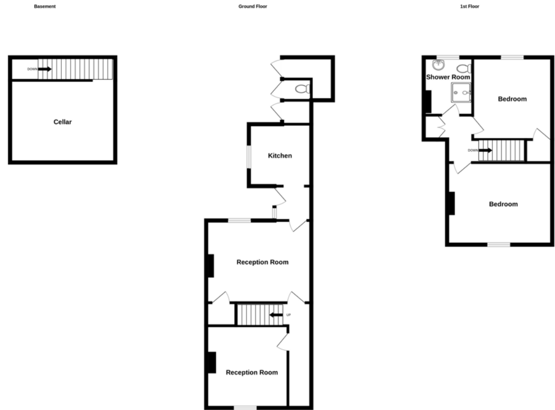
Measurements are approximate. Not to scale. Illustrative purposes only Made with Metropix ©2024

KINGSWINFORD HALESOWEN STOURBRIDGE BRIERLEY HILL SEDGLEY